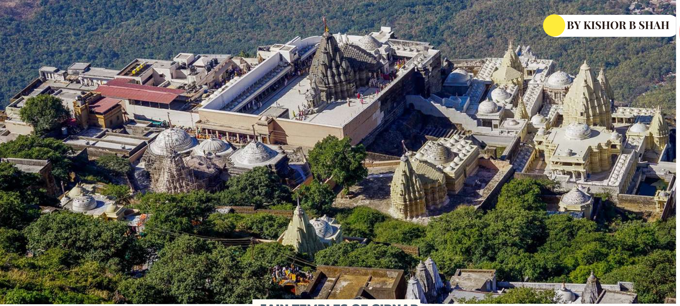
JAIN TEMPLES OF GIRNAR